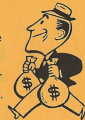
Gifts for camp and conference scholarship fund.